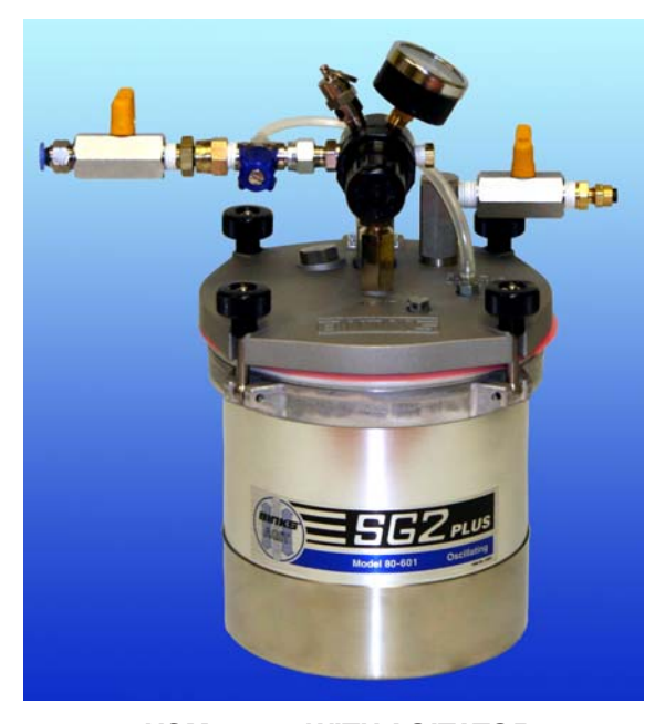
USM-80601 WITH AGITATOR

Universal's USM-80600 and USM-80601 Pressure Reservoirs are used to increase the ink supply pressure to the USMR-20AF markers. Higher supply pressure allows more ink to flow into the atomizing air stream in a given time interval. The use of the Pressure Reservoir enables shorter duration triggering signals to be used and results in a faster reaction time for the marker. The Pressure Reservoirs are also recommended in applications requiring higher ink volume delivery. For most applications, tank pressure is set to 2-3 psi.