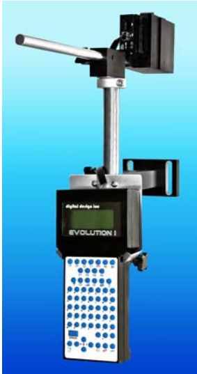
EVOLUTION I INK JET PRINTER

The Evolution I is a high resolution, large character ink jet printer. This compact system is powered with reliable printhead technology by Hewlett Packard at a price competitive with contact coders. This printer delivers bold, highly legible and fully formed characters at production line speeds of up to 200 feet per minute in a print resolution of 300 dpi.