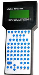
HAND HELD CONTROLLER

The Evolution I system comes equipped with an Arial font style in two character heights, 1/2" and 7/32". Print a one line message in 1/2" characters or two lines of text with the 7/32" high characters. Selecting the character size is accomplished through the font key on the hand held controller. The hand held controller has the capability of controlling up to 32 individual print head modules.